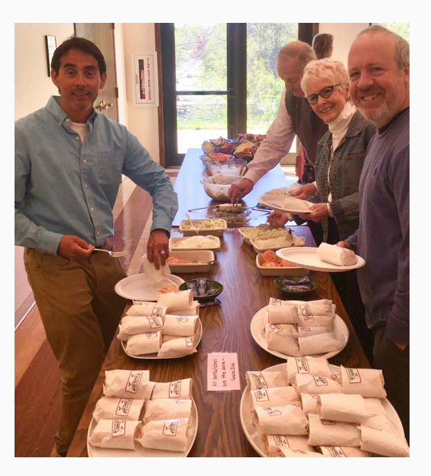
Our church friends helping themselves to a spread of Cousins subs, salads, and desserts provided by the Fellowship Team at the Church Potluck Celebration.