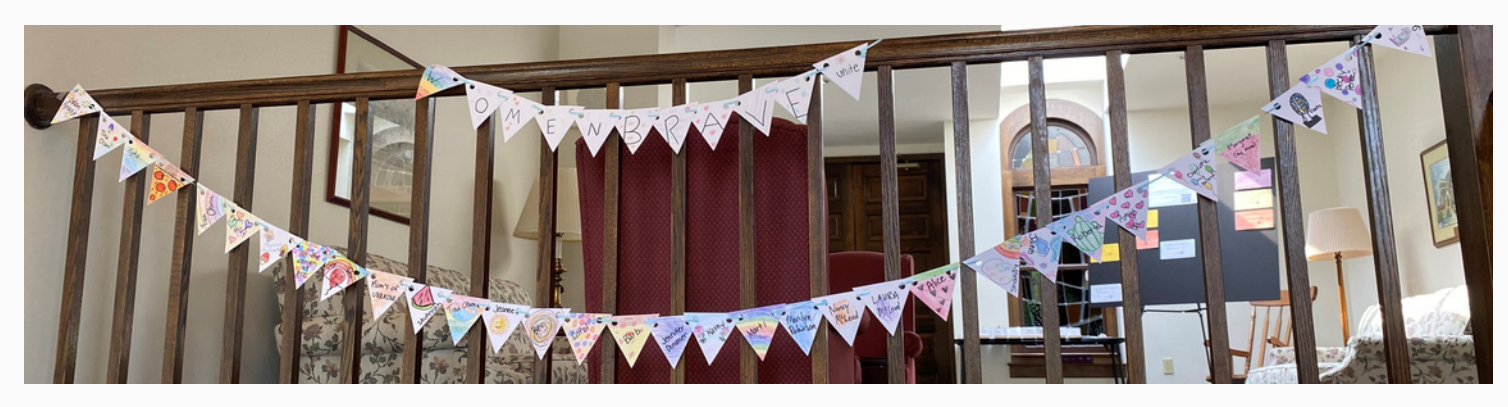
Pennants created to celebrate the important women in our lives!