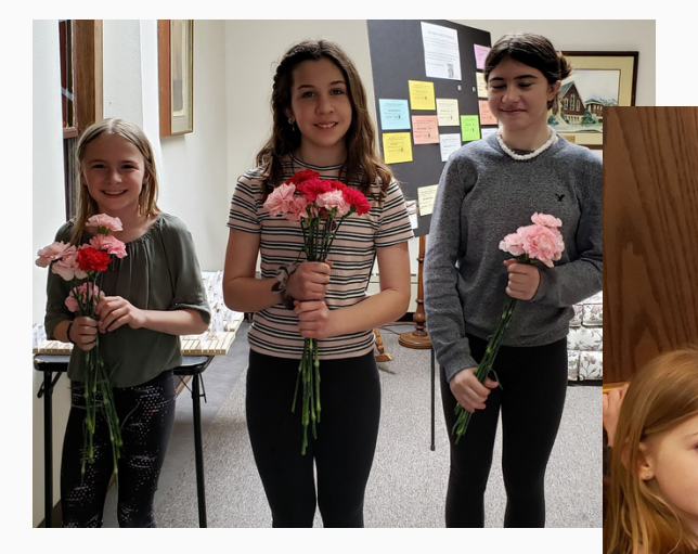
Flowers were handed out to special women on Mother's Day.